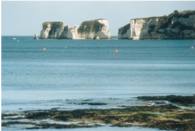
Sea view of Old Harry Rocks