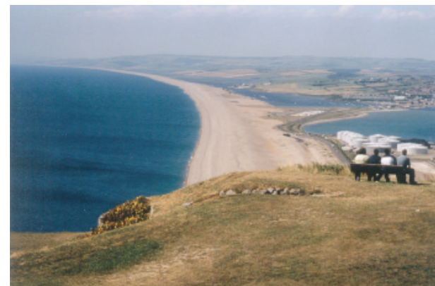
Chesil Beach view