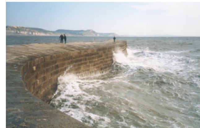
The Cobb at Lyme